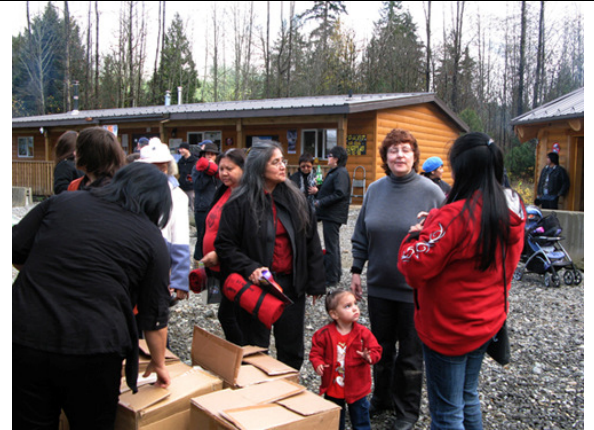
Community members gather to celebrate the completion of the Southern Communities Grid Connection project.