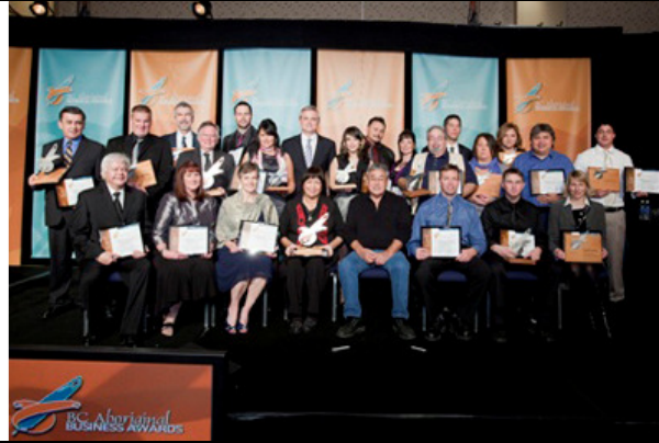
BC Aboriginal Business Awards recipients.