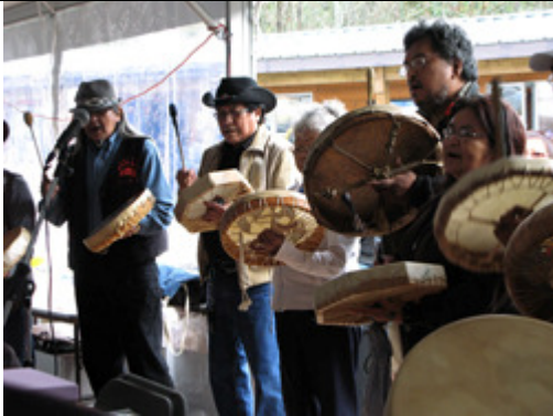
Lower St'at'imc drummers initiate the ceremony with a performance.

On November 12, 2010 members of the Lower St'at'imc Nations (Skatin, Douglas and Samahquam), and representatives from Canada, the Province and BC Hydro gathered to celebrate the completion of the Southern Communities Grid Connection project. The Lower St'at'imc Nations are now receiving clean and reliable power by connecting to BC Hydro's electrical grid through 30 kilometres of new distribution lines and two new substations, which replace diesel powered generators. Lower St'at'imc Nations are the first communities to receive electricity through BC Hydro's Remote Community Electrification program. The $30 million project was financed by INAC and BC Hydro.