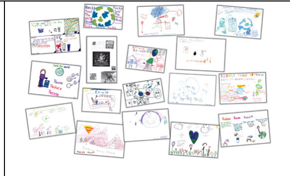
Bella Bella school children participated in a "Reduce, Re-Use and Recycle" poster contest to mark the naming ceremony for the new solid waste management facility.